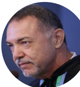
Paulo Cesar De Moraes

Title: Machine learning algorithms for surface plasmon resonance bio-detection applications, A short review